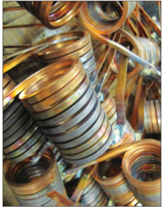
These thick-wall rectangular tank coils will end up in a full legal limit amplifier. Their considerable surface area and mass helps dissipate the extreme heat generated when the amplifier is running full power for an extended period. The taps are silver soldered and the entire inductor assembly will be glass beaded and silver plated for added efficiency.