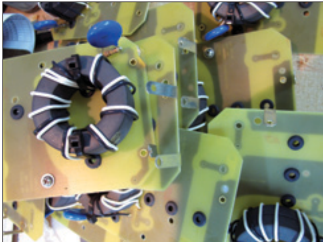
Up close, matching networks for a vertical antenna.