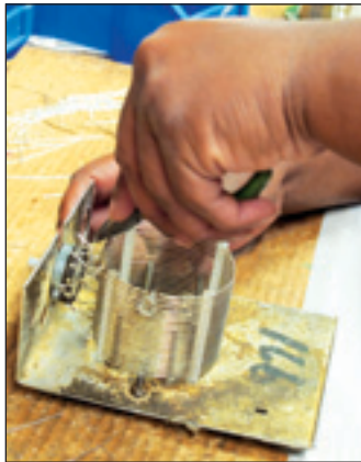
Wiring a high-Q air-wound inductor to a rotary switch for use in an antenna tuner.